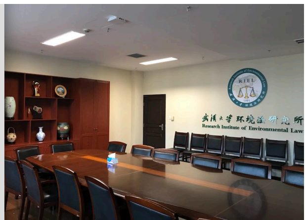
RIEL Meeting Room